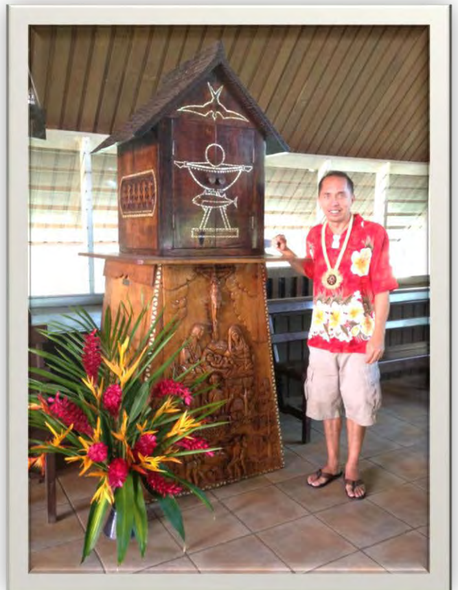
Holy Cross Catholic Church