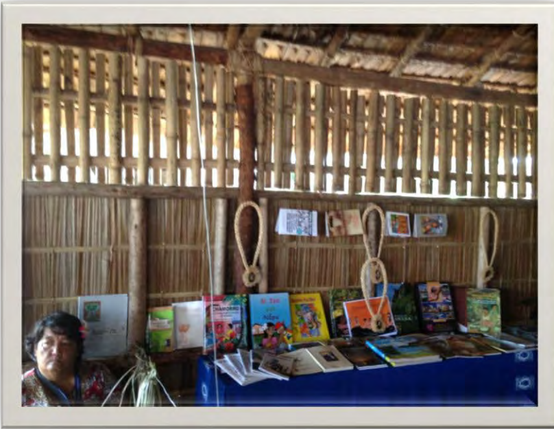
Literary publications displayed at the Guam hut.