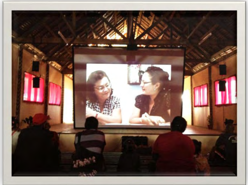
Tetehnan play presented at the National Auditorium.