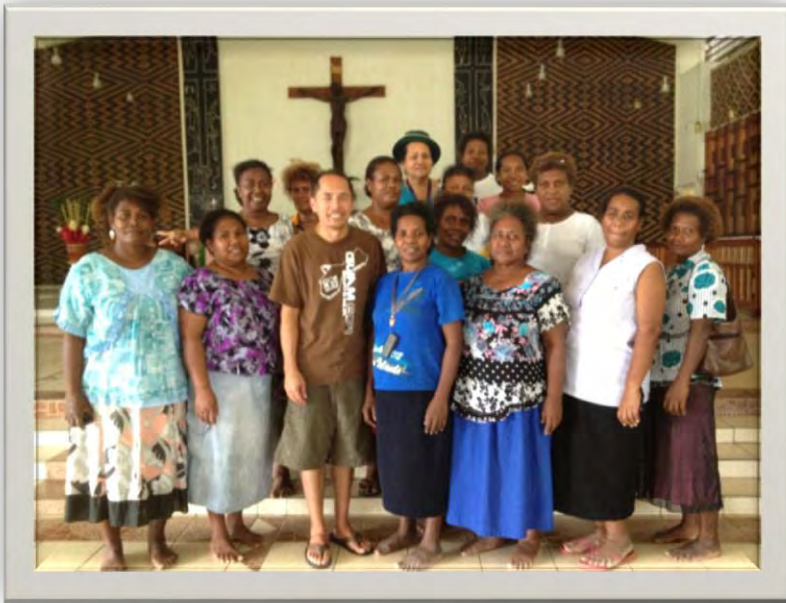
Saint Barnabas Anglican Church